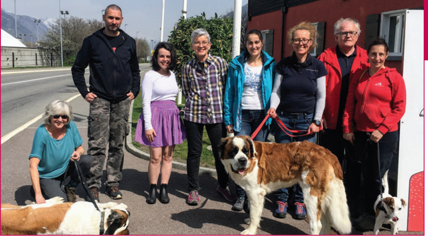
Pet Partners staff and team evaluator candidates at the Switzerland practicum

evaluator, is serving as a Pet Partners International Program Educator, bringing his experience to help prepare prospective international volunteers. For him, working with international candidates has been illuminating and deeply fulfilling. “With the international practicums I noticed a great amount