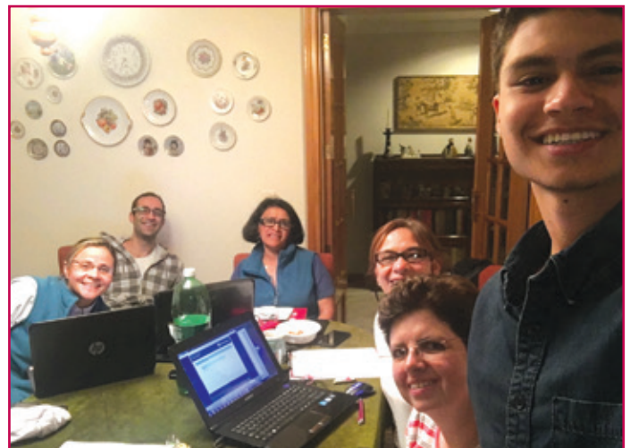
Prospective volunteers in Colombia work on their Pet Partners coursework