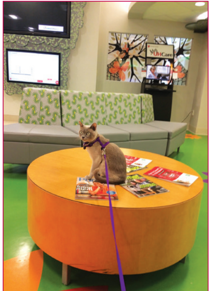
Pearl is right at home visiting at Rainbow Babies and Children's Hospital

Since gaining full privileges, Geryl and Pearl have been visiting Rainbow Babies and Children's Hospital in Cleveland three times each month. "Pearl is a star! I knew