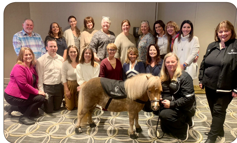
Pet Partners' Board of Directors gathered in Chicago and spent time with therapy horse Poppy.